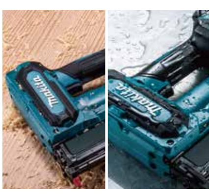
eXtreme Protection Technology